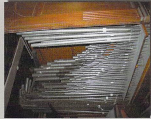
Pipe case, one of 2 in order to hold a total of about 900.

It can play 58 note, 116 note and 176 note Duo Art rolls.